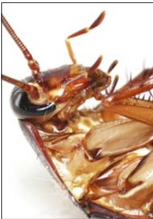
HSG251(Second edition) Published 2015

Health and safety guidance for employers and technicians carrying out fumigation operations