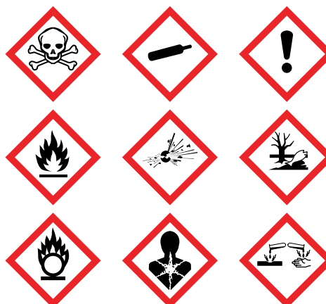
Figure 1 Pictogram of new International Symbols