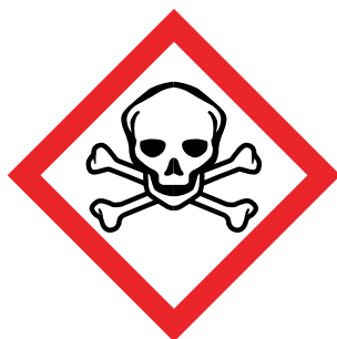
Figure 3 Poison warning symbol

112 Certain substances are subject to the provisions of the Poisons Act 1972. 18 This will be indicated on the product label. Where a product label indicates that a substance is subject to the Poisons Act, employers must familiarise themselves with the requirements of the Act. Aluminium phosphide is an example of a substance subject to the provisions of the Poisons Act.